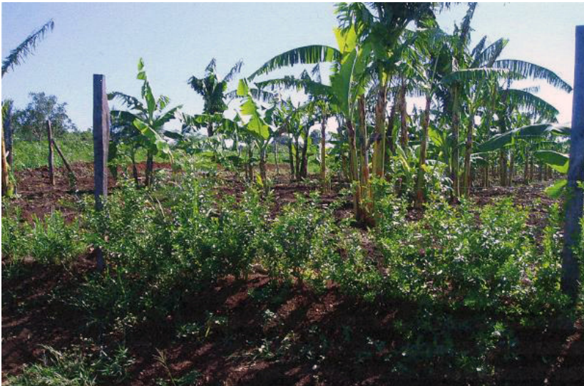
Eingezäunte Bananenplantage in Bumala

Das Projekt leistet Hilfe zur Selbsthilfe, ein wichtiger Punkt unserer Vergaberichtlinie und hat uns deshalb überzeugt. Die Support Gruppe hat beschlossen, den Bumala-Trust mit CHF 2'320.- zu unterstützen.