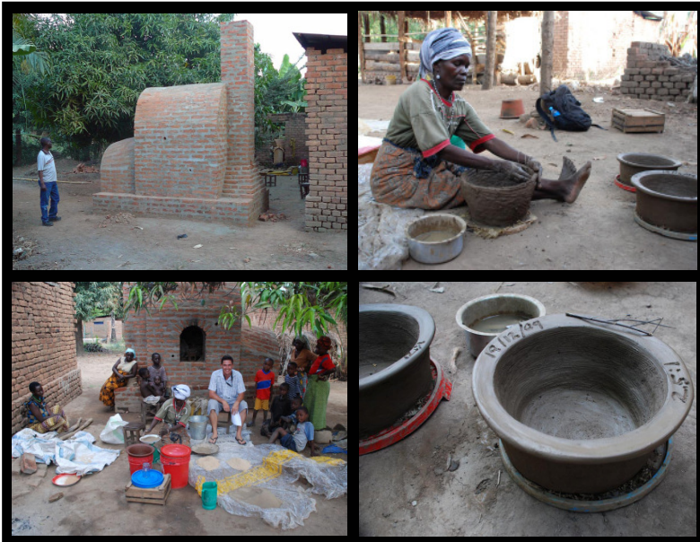
Impressions from the pottery in Ifakara