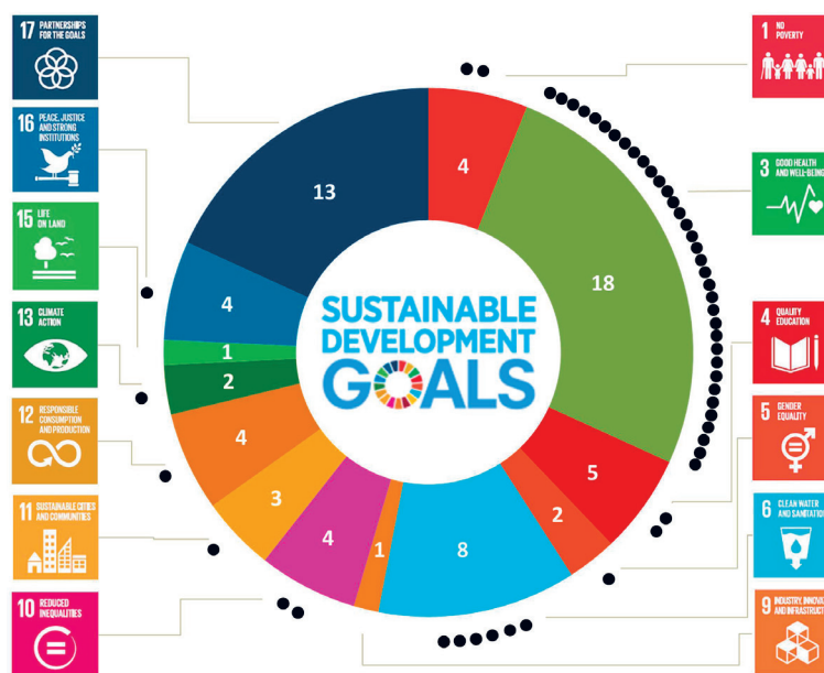
Figure 1. Sustainable Development Goal (SDG)-donut chart indicating the three most important SDGs among the 23 presenters and chairs (n = 23) of a one-day symposium jointly organized by the Swiss Tropical and Public Health Institute (Swiss TPH) and the Swiss Network for International Studies (SNIS), held in Basel in November 2018. The black dots represent the number of votes for the single most important SDG from the audience that participated in the e-poll at the beginning of the symposium (n = 52).

Over the course of the event, two themes emerged: (i) the interconnection of the SDGs and (ii) the need for collaboration and novel partnerships. Hereunder, four challenges became clearly visible and prompted discussions as to potential solutions. The challenges were confirmed by the e-poll at the end of the event, underlining their importance in the 2030 Agenda for Sustainable Development beyond the health-related targets.