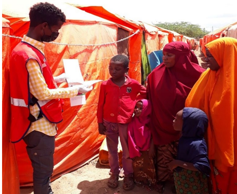
Community volunteer in Balcad