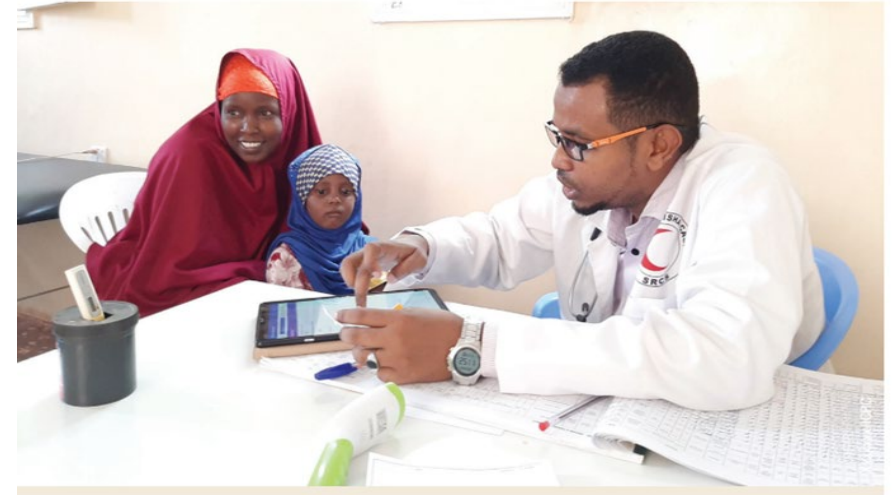
SRCS Clinic Afgoi

Thank you very much for your attention, any questions?