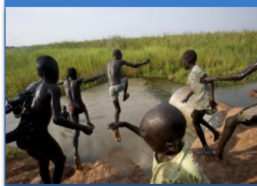
Photocategory 3 #BetterWorld