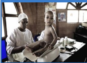
Photocategory 2 #CareTogether