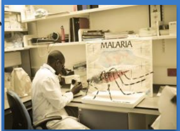
Photocategory 1 #InnovateTogether