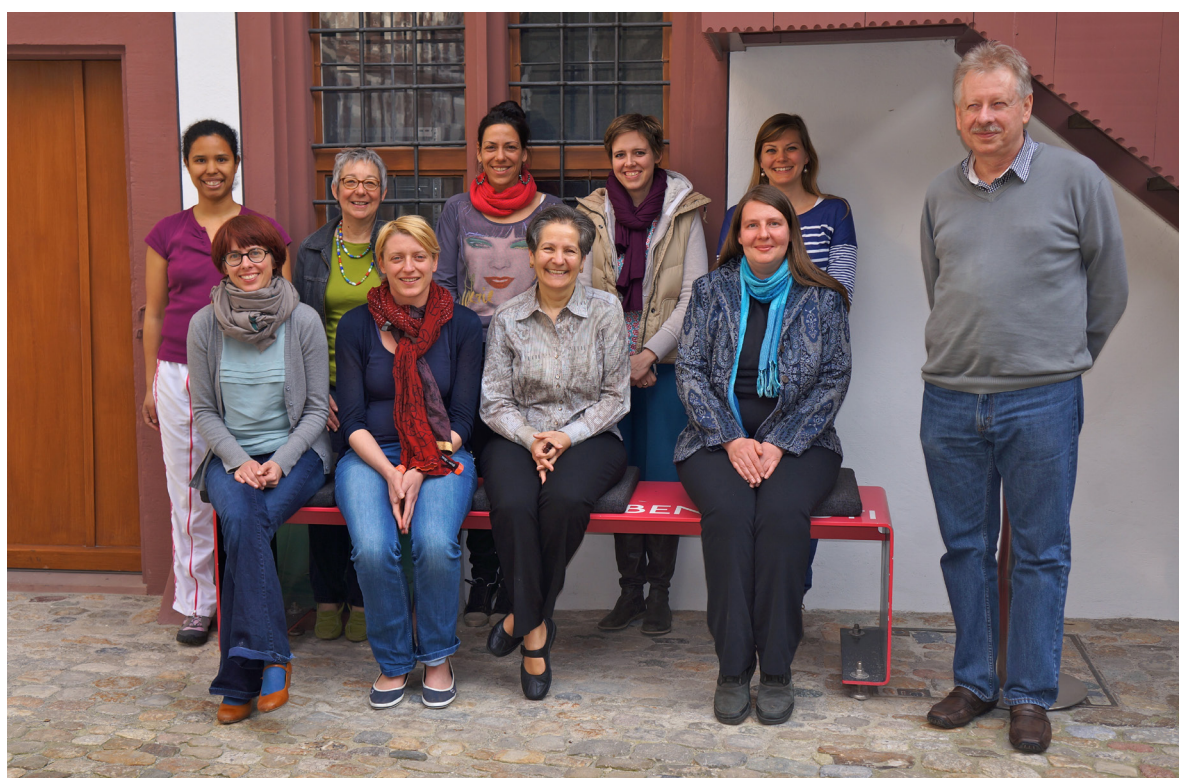
MARG Members, March 2014